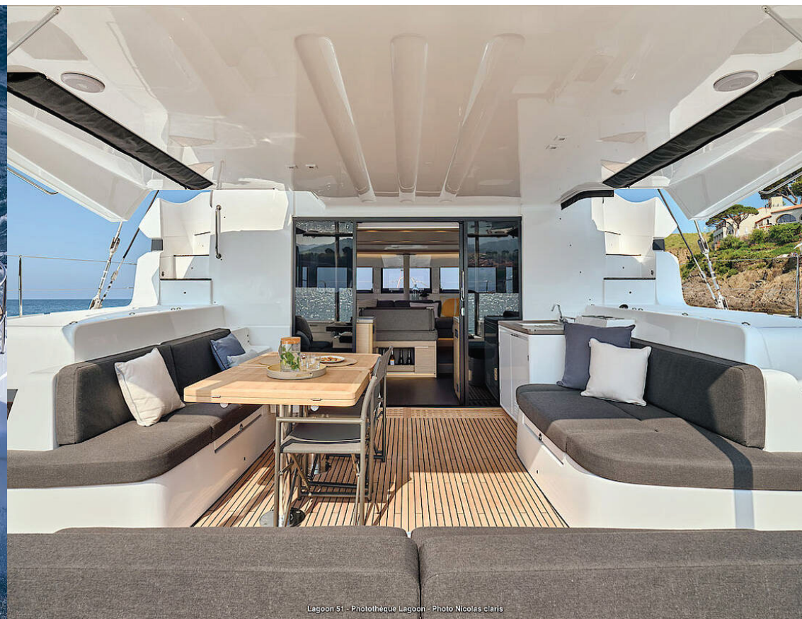
Lagoon 51