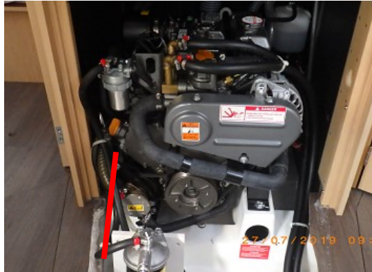
Engine Oil level