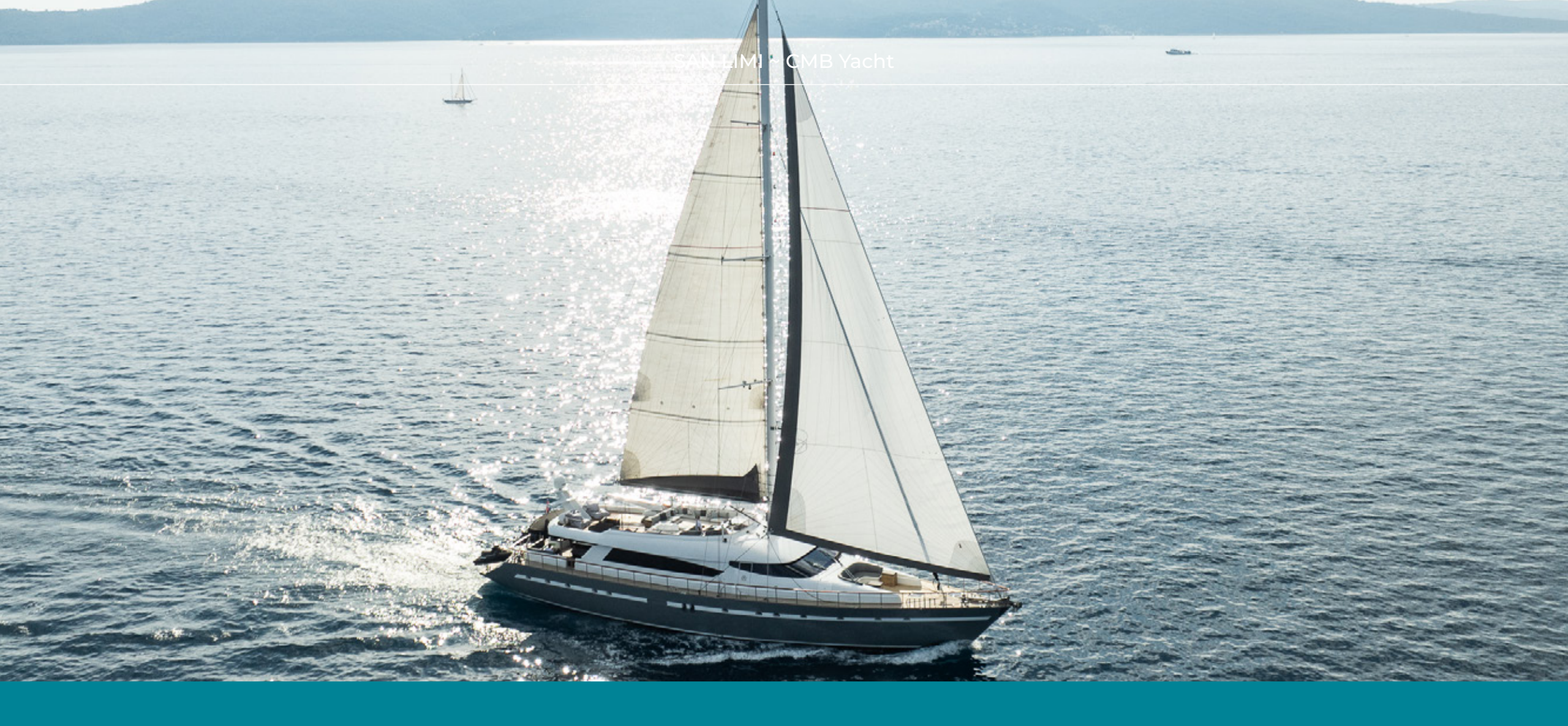
Loa 34.80 m (114' 2") Beam 8.20 m (26' 11") Draft 3.5 m (11' 6") Built 2007 Refit 2020 Guests 8 Crew 5 Builder CMB Yachts Hull Material Composite Hull Configuration Displacement Superstructure Flybridge Yacht type Motor-sailer