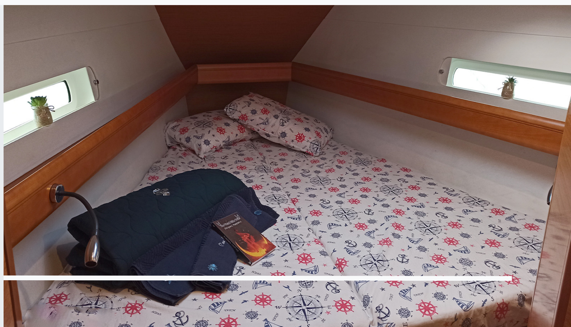
3 cabins // 2 heads // up to 8 guest // build in 2017